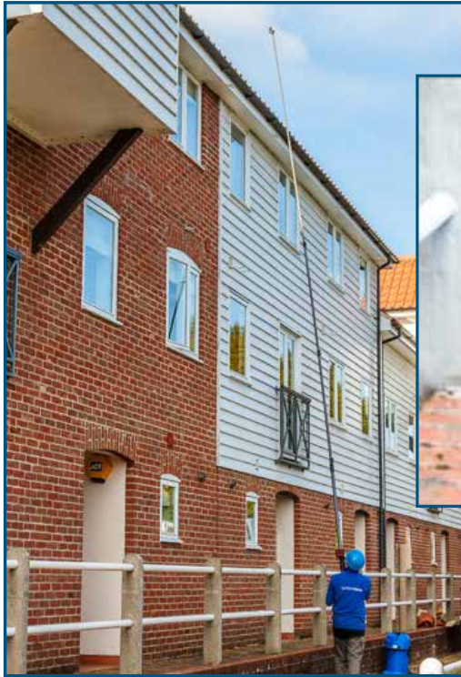
Camera survey conducted in order to provide quote.

The wireless cameras are an invaluable part of our operation. We conduct a camera survey as standard when we quote – we can reach up to 15m (40ft). Once cleaning is completed we use the camera to check that all debris is removed and the gutters are clear.