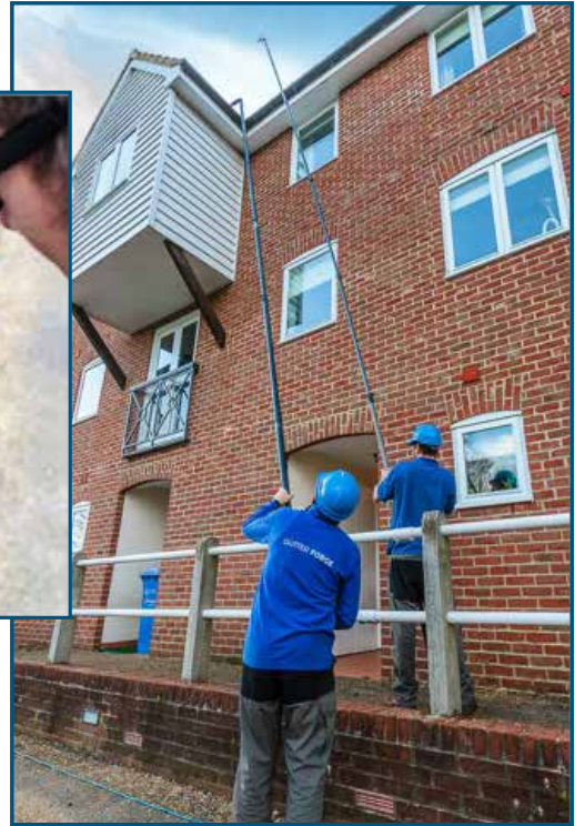
Using the camera during cleaning of a tricky area.